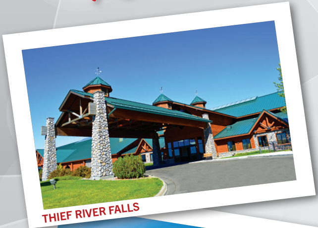
THIEF RIVER FALLS